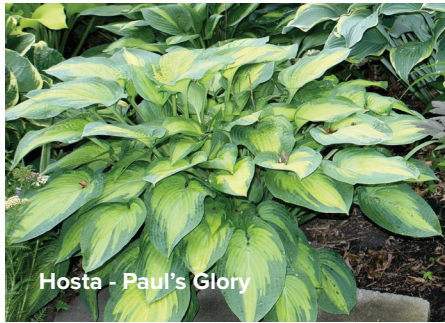
Hosta - Paul's Glory

leaves, mostly white with irregular dark green margins. Stems and flower scapes are cherry red. HT. 24"