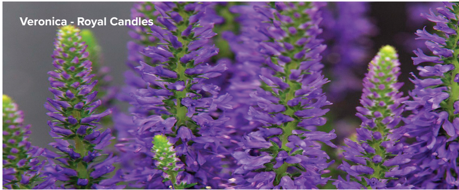
Veronica - Royal Candles

drained soil, but will grow in a shady location and even soggy soil. Low maintenance is assured. It forms a slowly expanding mound and blooms in late summer and early fall.